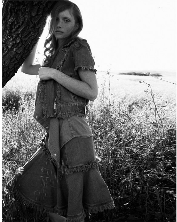
Biker vest & skirt, by MICHAEL Michael Kors. Shirt, by Calvin Klein Jeans.